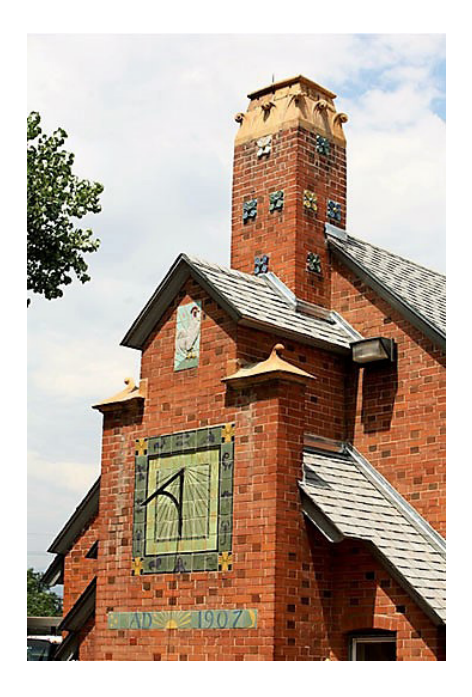
Van Briggle Pottery

Non-Profit Org U.S. Postage PAID Colo Spgs, CO Permit No. 745