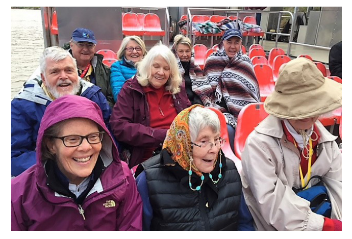
WES members smile at the start of the Moab River cruise, just one memorable part of the Spring Utah WES-PILLAR Trip.

thoughtfully-planned, expertly executed and uniquely engaging Southwest group tour anywhere!